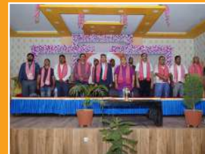
Welcome & Farewell Program