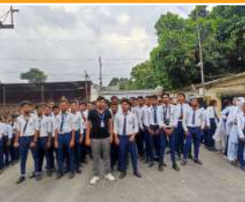
Historical Place & Industrial Tour

The College organized 1 Day Training regarding Learn, Earn & Save on 8 th Chaitra, 2080 on the occasion of Global Money Week.