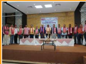
Academic Training Program