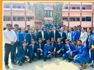
Janakpur High Court Visit